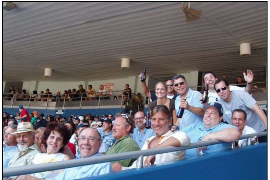
Columbian Lawyers Association Yankee fans