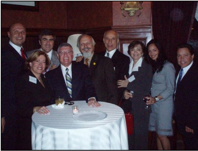
Columbian Lawyers enjoying the festivities with Judge Kapnick, Judge Mastro and Judge Pesce