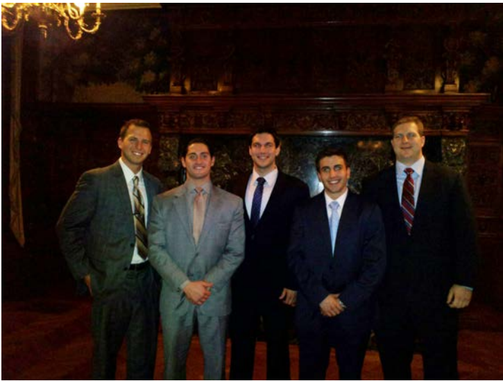
New York Law School students